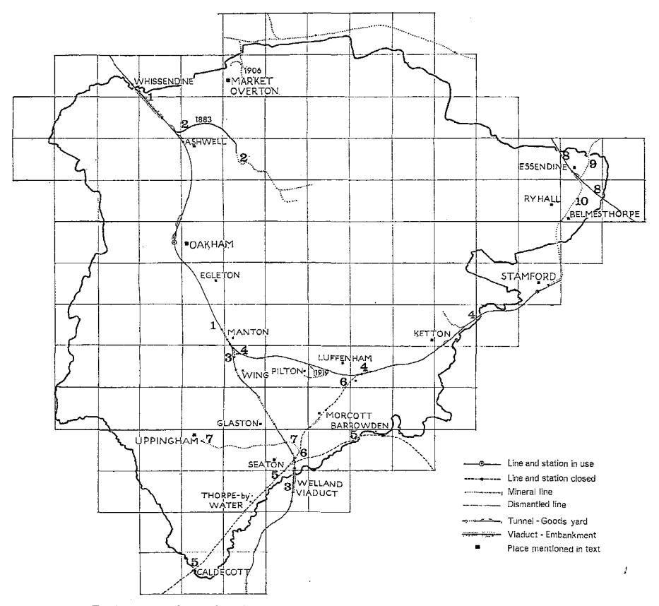
FIGURE 1. Railways of Rutland

periodical burning, and from time to time the scrub is cleared by hand cutting. No doubt the periodicity has been established by trial and error over the years, and one object of the practice was to discourage such rank growth as would constitute a serious fire risk in the days of steam traction. The result has been to discourage the excessive growth of coarse grasses and nettles, and to encourage the more delicate species. So, in some respects, railway grassland resembles old pasture controlled by cutting and grazing, or moorland which is regularly burnt.