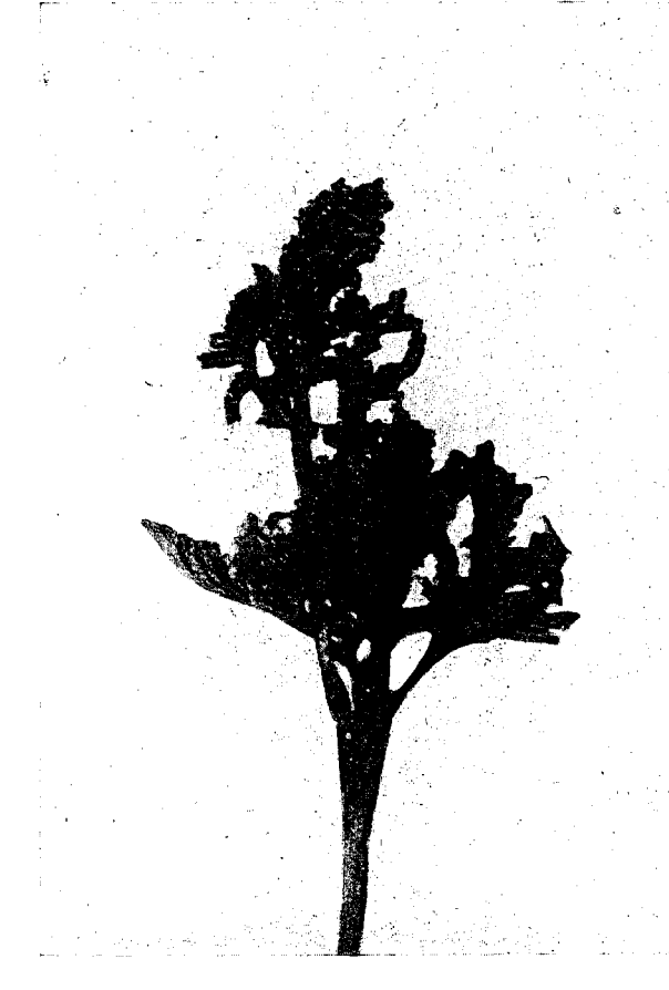
BOTRYCHIUM RUTACEUM SW.