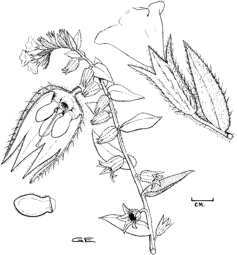
Nonea lutea (page 18)

Cowpasture Farm, Felixstowe, Suffolk IP11 9RD